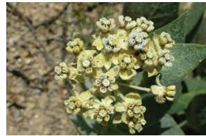
Desert Milkweed Asclepias erosa Desert regions.