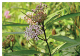
Aquatic Milkweed Asclepias perennis Hydrated soils.