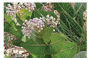
Sandhill/Pinewoods Milkweed Asclepias humistrata For use in some regions of FL. Dry sandy areas and soils.