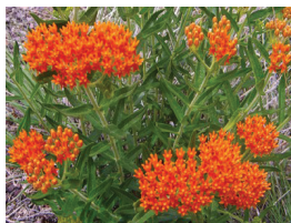
Butterfly Weed Asclepias tuberosa Well-drained soils.