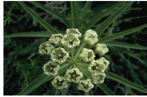
Antelopehorn Milkweed Asclepias asperula Desert and sandy areas.