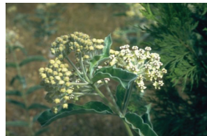
Woolly Pod Milkweed Asclepias eriocarpa Clay soils and dry areas.