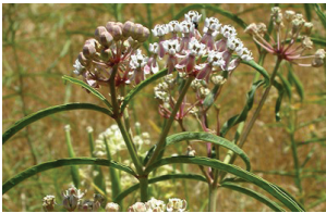
Mexican Whorled Milkweed Asclepias fascicularis Dry climates and plains.