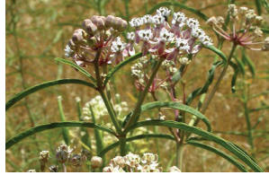
Mexican Whorled Milkweed Asclepias fascicularis Dry climates and plains, except in CO, UT, NM & AZ.