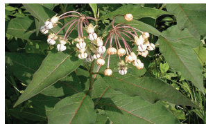
Poke Milkweed Asclepias exaltata Woodland areas (except in NE, KS, MO, ND & SD).