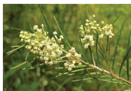
Whorled Milkweed Asclepias verticillata Prairies and open areas.