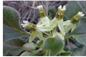
Zizotes Milkweed Asclepias oenotheroides Sandy or rocky prairies and fields.