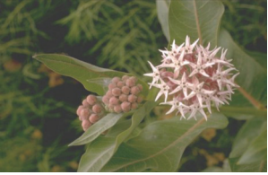
Showy Milkweed Asclepias speciosa Savannahs and prairies.

NOTE: Excludes California and Arizona; see below for those regions.