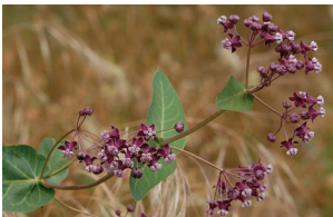
Heartleaf Milkweed Asclepias cordifolia Rocky slopes.