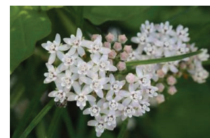
Arizona Milkweed Asclepias angustifolia Riparian areas and canyons