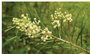
Whorled Milkweed Asclepias verticillata Prairies and open areas.