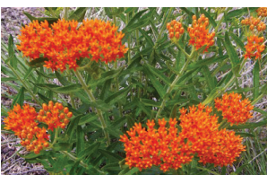
Butterfly Weed Asclepias tuberosa Well-drained soils.