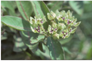
Green Antelopehorn Milkweed Asclepias viridis Dry areas and prairies.