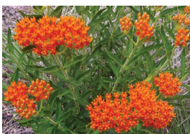
Butterfly Weed Asclepias tuberosa Well-drained soils.