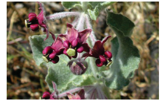
California Milkweed Asclepias californica Grassy areas.