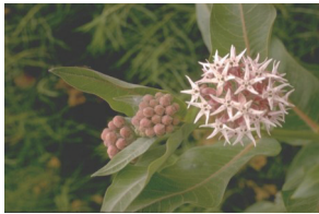
Showy Milkweed Asclepias speciosa Savannahs and prairies.