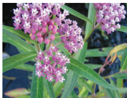
Swamp Milkweed Asclepias incarnata Damp, marshy areas.