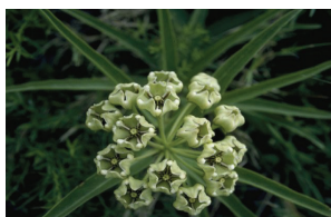
Antelopehorn Milkweed Asclepias asperula Desert and sandy areas.