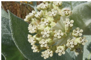
Woolly Milkweed Asclepias vestita Dry deserts and plains.