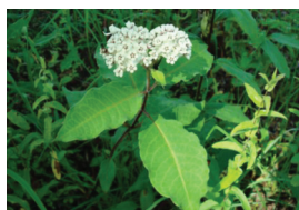
White Milkweed Asclepias variegata Thickets and woodlands