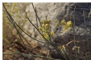
Rush Milkweed Asclepias subulata Desert areas.