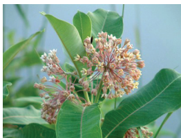
Common Milkweed Asclepias syriaca Well drained soils.